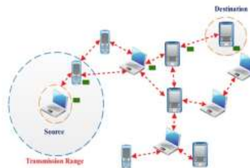
Figure: Structure of MANET[11]

The mobile ad hoc network (MANET) is one of the most growing field for research purposes. It helps for the development of the wireless network. This network is consisting with dynamic topology and applied for provide security purpose. In this network nodes are free to move in any direction. They move for one place to another place with the help of signals. Because every node has a particular IP address and this is provide to every node separately. They have no any physical connection and some time the nodes